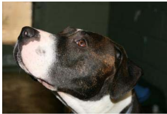
Storm's adoption fee is $100

big, bouncy pitbull, it was causing a major problem with the leg, and would require extensive physical therapy & months of healing. Through Greenhill's Mend a Friend fund , which uses private donations to give more shelter animals life saving medical treatments in order for them to lead healthy lives with loving families, a dog like Storm has a chance of leading a normal happy life. Storm had surgery on her knee in July, but unfortunately, due to her playful, active nature, she re-injured the knee shortly afterwards. After numerous repeat trips to the orthopedist, 7 months of strict exercise limitations, pain medications, and the help of her amazing foster parents, Storm is now able to lead a normal, albeit physically modified, life. Though her foster family fell in love with Storm, they realized their lifestyle wasn't the best fit for her, reluctantly returning her to the kennel in hopes of giving this loving gal a second chance at finding her forever home. Storm's adoption fee is $100 and she is available for adoption now. To view more adoptable dogs, cats, or small animals, click HERE .